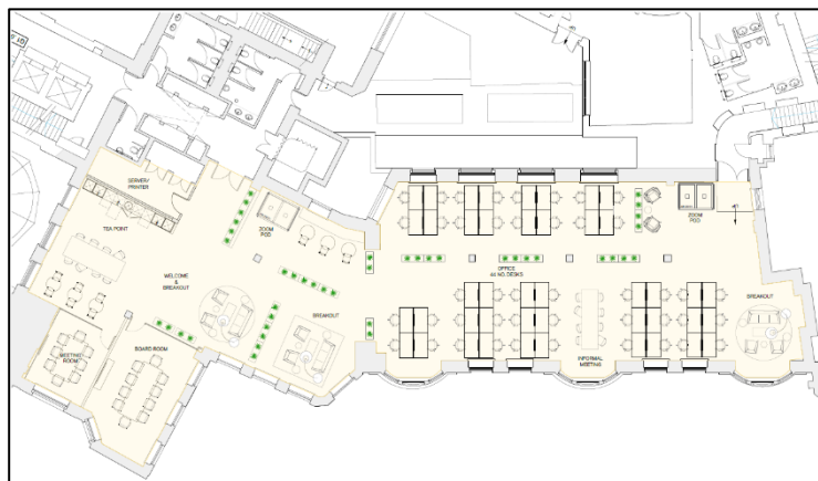
Part 1 st Floor Layout